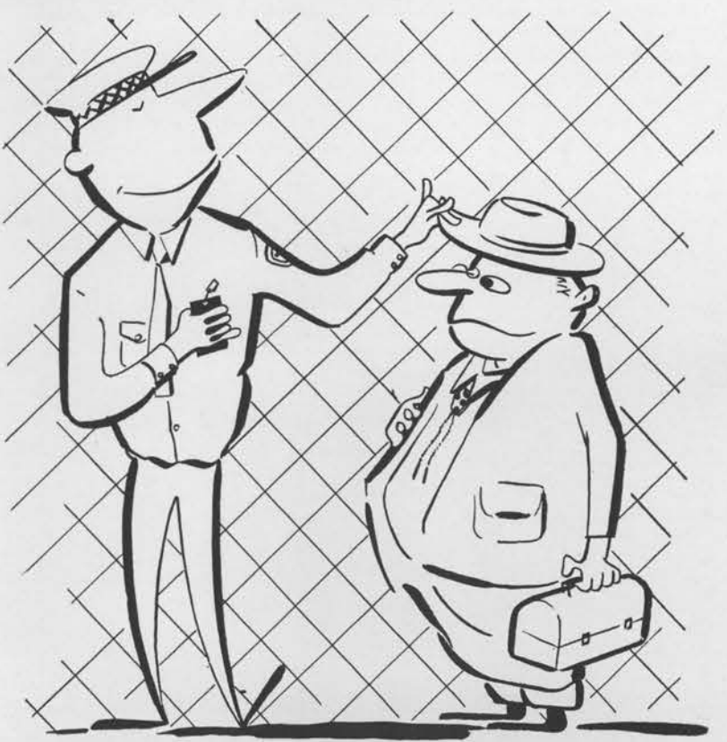
THE GUARDS, the badges and the fences—all do a good job. But ultimately, Security is up to you. It is part of all employees' jobs.

More than 150 engineers from missile, aircraft and electronics throughout the country firms have attended the two-week course which is designed to fill the need for information in the highly specialized and rapidly developing field of vibration testing.